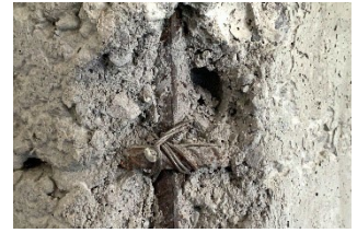
Demolition of deteriorated concrete

The information contained in this technical data sheet, while representing the most advanced stage of knowledge, does not exempt the user from performing accurate preliminary tests under their own conditions of use and operation. We therefore decline all responsibility for the improper use of the product.