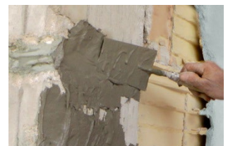
Restoration mortar (GRAUTEK)