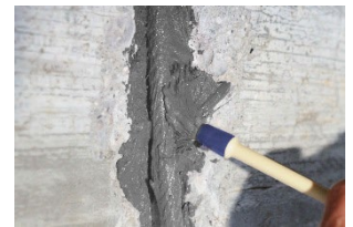
Application of PROTEK on irons