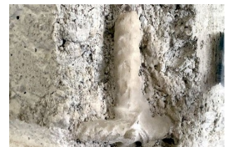
PROTEK after 1 h